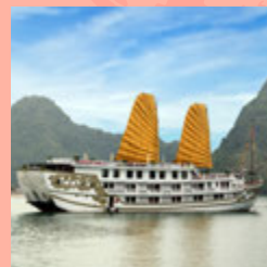
TRAIN & BOAT BOOKINGS