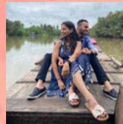
WEDDING & HONEYMOON TRIPS